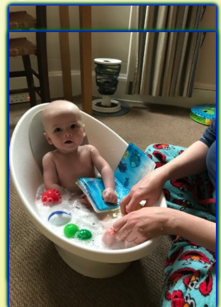
Mum won't give me time to relax. She's just like my Teacher.