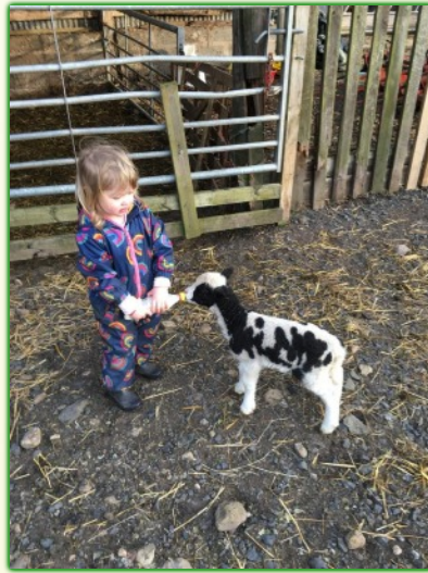
Feeding the lamb