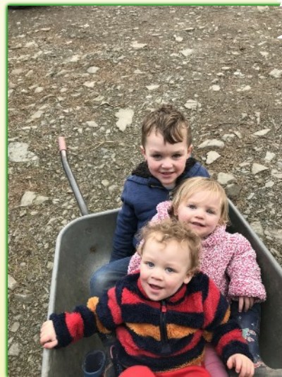
Waiting on a lift