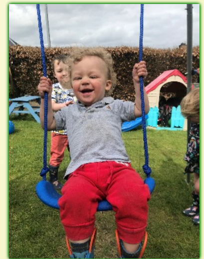
Back Garden Fun