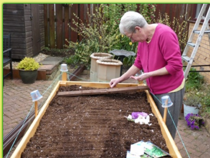
Old Mill Nursery. Temporarily closed due to Lockdown.