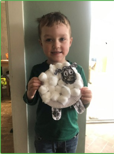
Mum hasn't missed the-cottonwool yet.