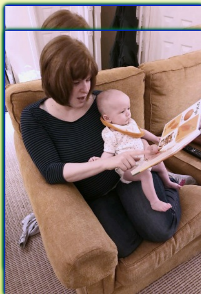
No School! No Internet! But Mum insists on lessons.